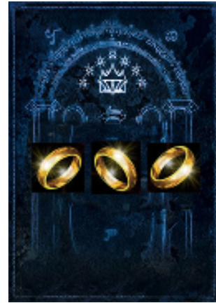
Figure 1: A gate in the Mines of Moria that is controlled by an ancient Rune